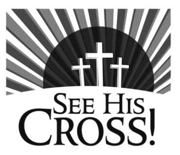
2014 Midweek Lenten Worship

SURPRISING WORDS FROM OUR SAVIOR'S PASSION